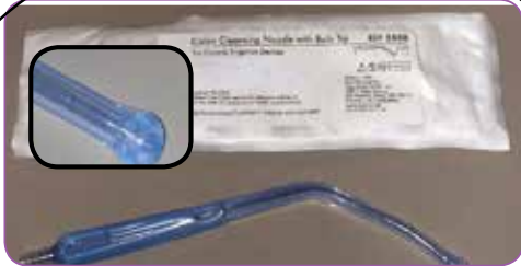
Cleansing Nozzle: Curved Bulb Tip - RX