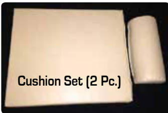
Cushion Set (2 Pc.)