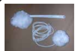
• Plastic Handle Mop • Mop-on-rope (snake)

CONNECTOR NOZZLE Flex Tubing connection can wear out - Barbed End Replace when needed!