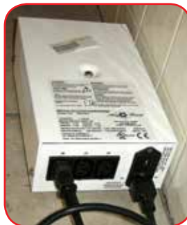
Medical Grade Isolation Transformer Box & Cord